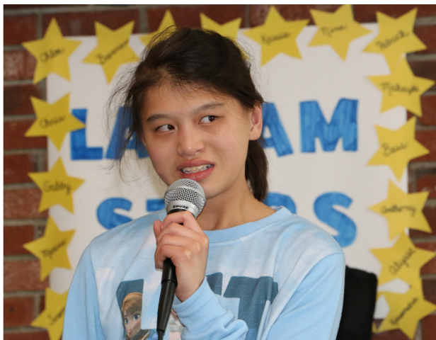
Latham Centers' residents share their musical gifts.